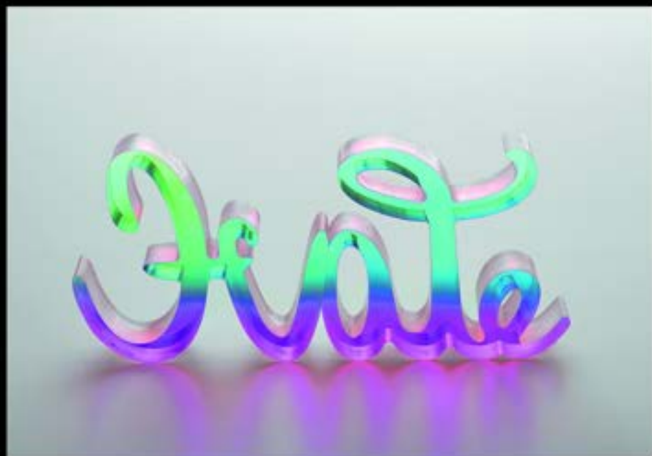
LOVE HATE, 2021 Mia Florentine Weiss Rainbow Acrylic Small version: 9.5 x 24 x 6 cm Large version: 19 x 48 x 12 cm Unlimited LOVE Edition