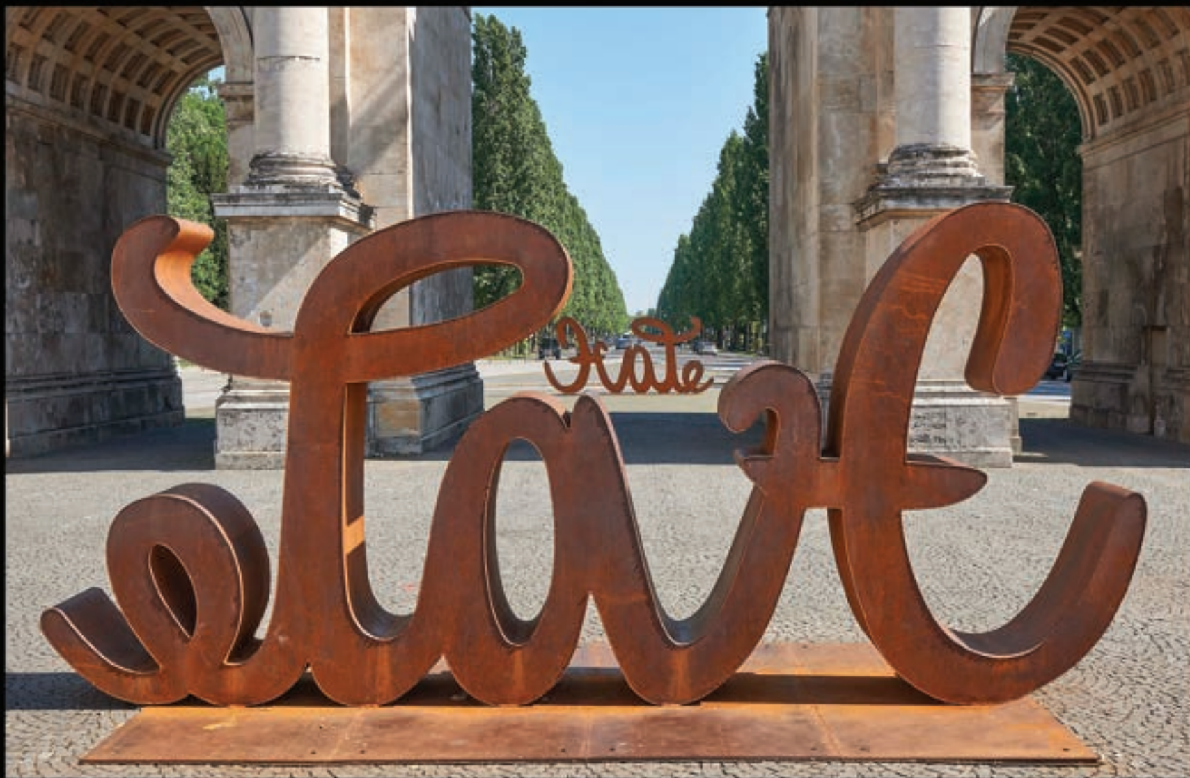
LOVE HATE, 2019 Mia Florentine Weiss Steel 220 x 500 x 200 cm Masterpiece Edition